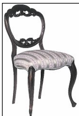
STYLE: A balloon back chair