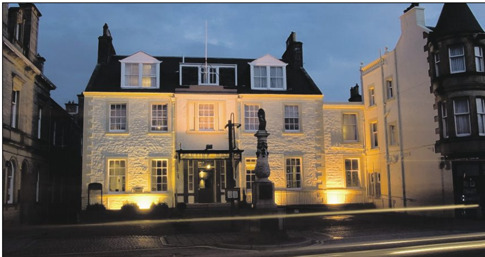
BORDERLINE: The Tontine Hotel in Peebles offers a wide range of activities, including a Garden Lovers' Trail which takes in Kailzie Gardens (below)