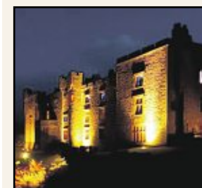
SHOW: Muncaster Castle